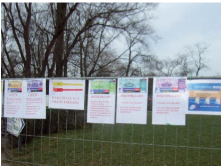
Signs at the entrance of the areas